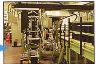
Automated Cell Assembly Line